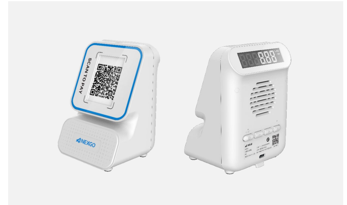
KD68 S: 4G+Segment display + 2.4" TFT display