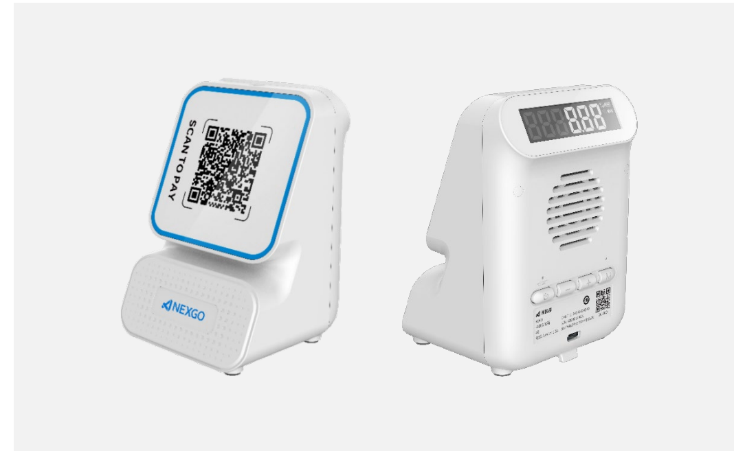
KD68 V: 4G + Segment display