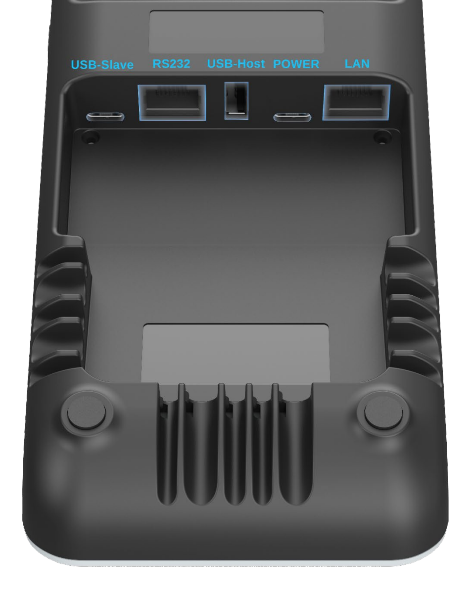
Charging + Wireless Wi-Fi