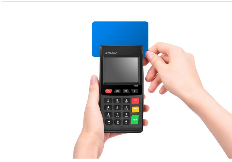
Magnetic Strip Cards

K300 accepts payments of magnetic strip cards, IC cards and contactless/NFC.