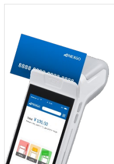
Magnetic Stripe Cards