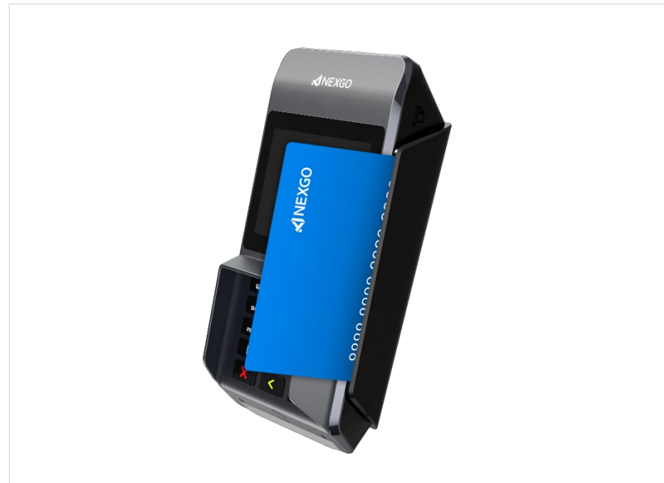
Magnetic Stripe Cards

G201 accepts payments of magnetic strip cards, IC cards and contactless/NFC.